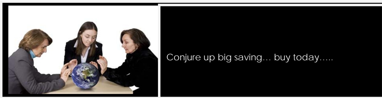
Graphic pixels are: 300 Width x 175